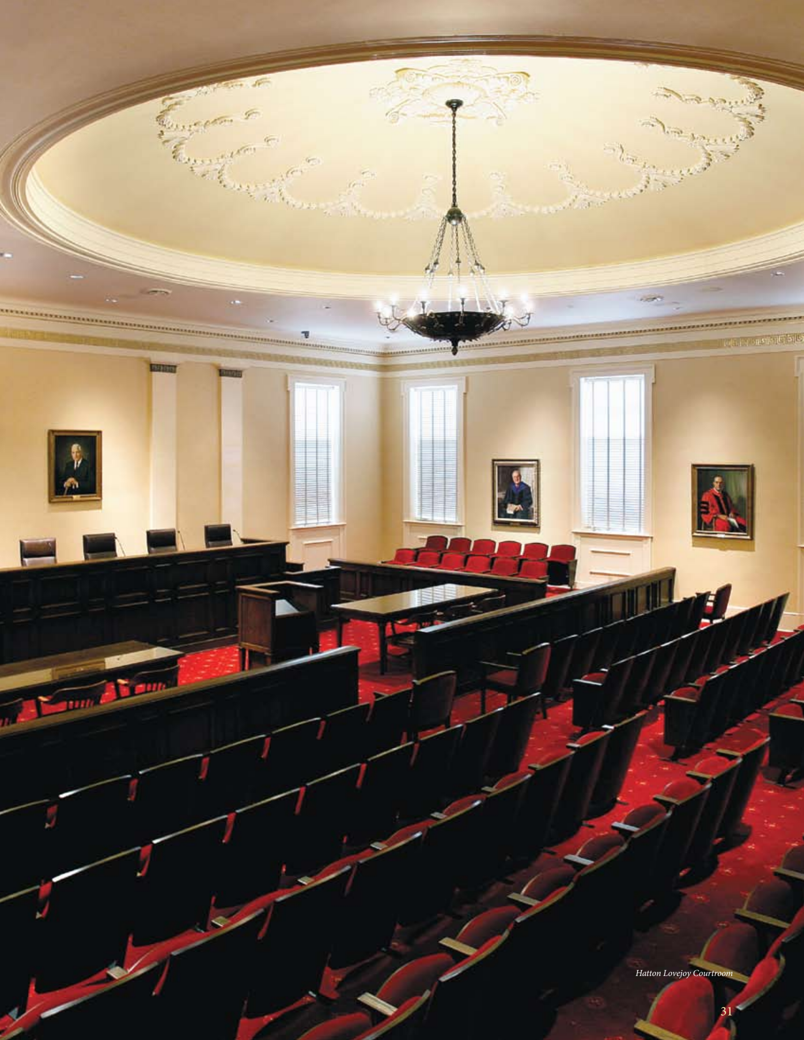
Hatton Lovejoy Courtroom