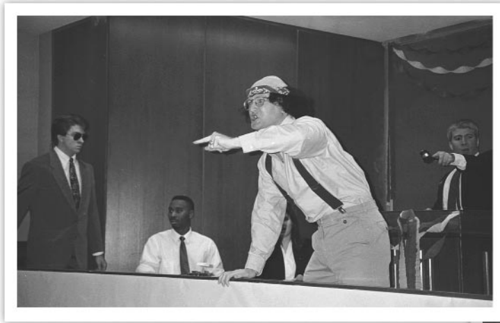
An outburst in the courtroom during the Palsgraf v. Long Island Railroad Co. trial in 1995. ▲