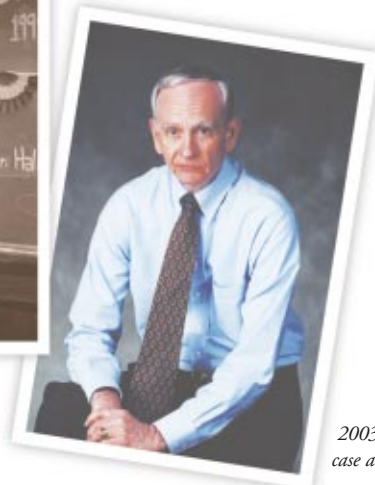
2003 – the 75th anniversary of the case and the 40th anniversary of the naming of the first "P.P."