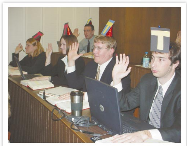
This year, with their left hand on their torts textbook and their right hand raised, students repeat the sacred Palsgraf oath.