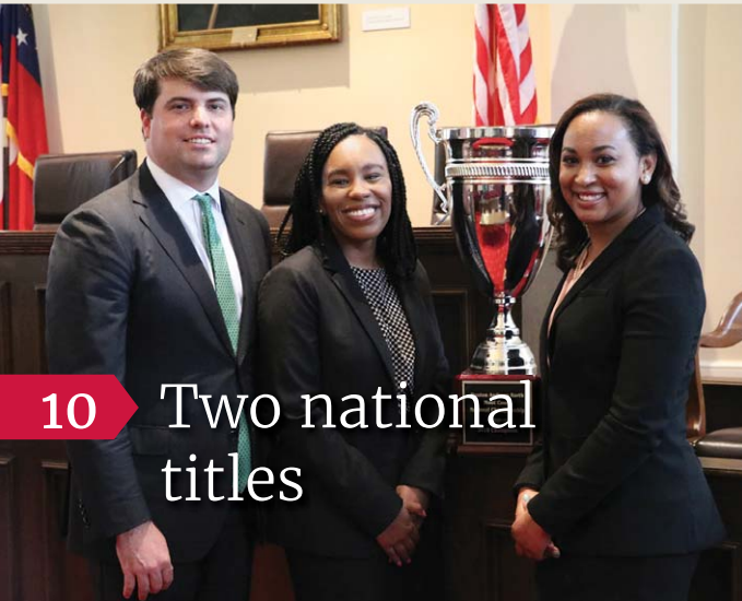
10 Two national titles