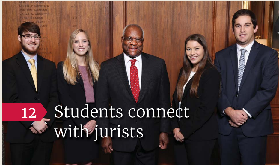
12 Students connect with jurists